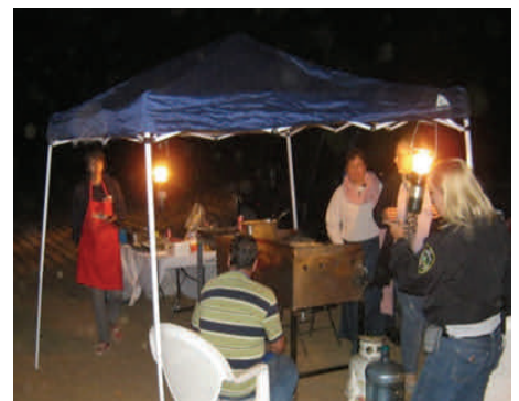
Food was open to the elements, dirt, dust, and insects, which can lead to food borne illnesses