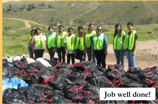
Job well done!