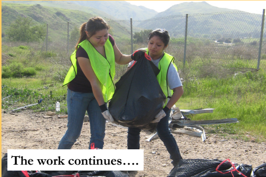
The work continues....