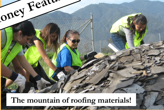
The mountain of roofing materials!