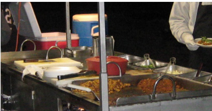
Illegal taco stand

making Riverside County a safe place to live and visit, by identifying and eliminating hazardous and illegal activity.