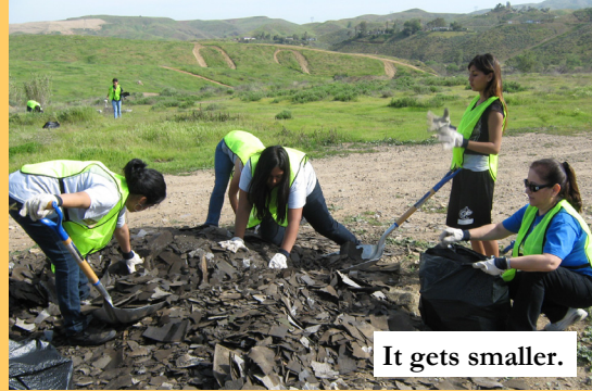
It gets smaller.