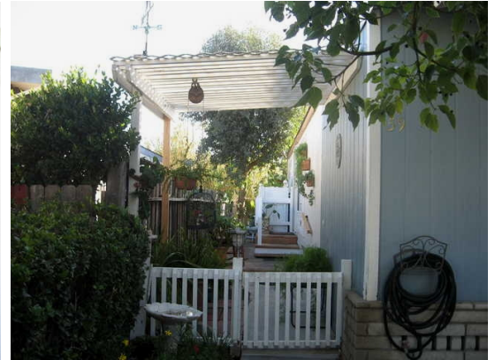
Room addition removed