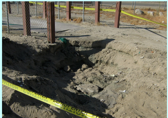
After immediate danger removed