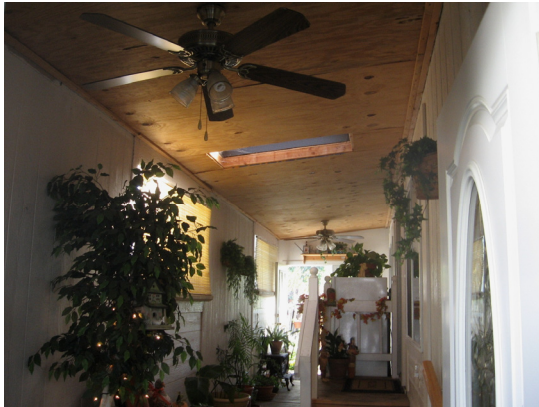
Unpermitted room addition

Riverside County Code Enforcement Officer Molina received a complaint of an alleged room addition that was built and attached to a mobile home located in District 1. The officer drove to the location and observed an additional room, constructed of wood, and attached to a mobile home. This room addition is used as the main entrance to the mobile home.