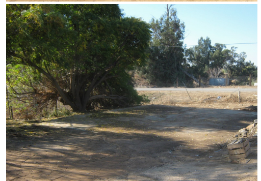
Above: Structure posed danger to area Below: Clean and safe