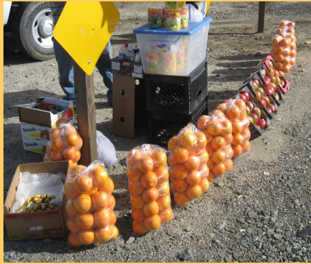
Illegal vending operation

This is a clear example of why it is unsafe to buy produce or food from illegal vendors. Consumers need to be careful and only purchase produce and other food items from legal vendors.