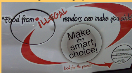
Environmental Health vehicle