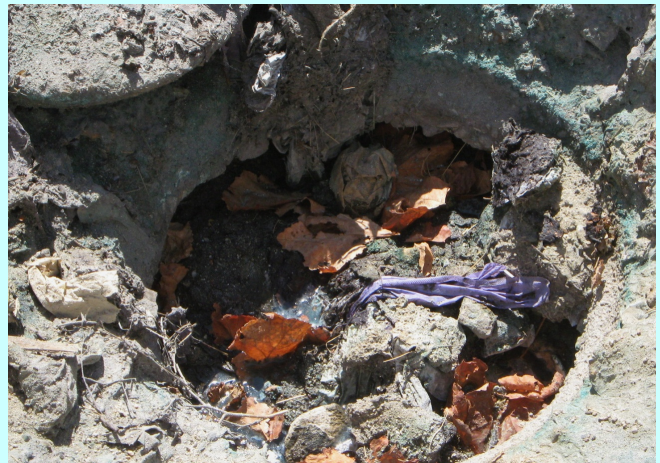
Exposed and full cesspool tank opening