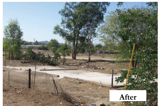
This building on Highway 74 has been removed