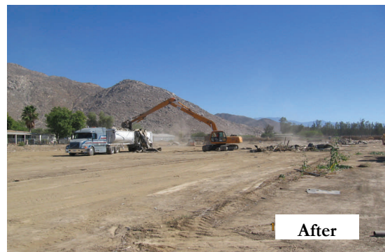
Approx. 1,219,680 square feet of rubbish