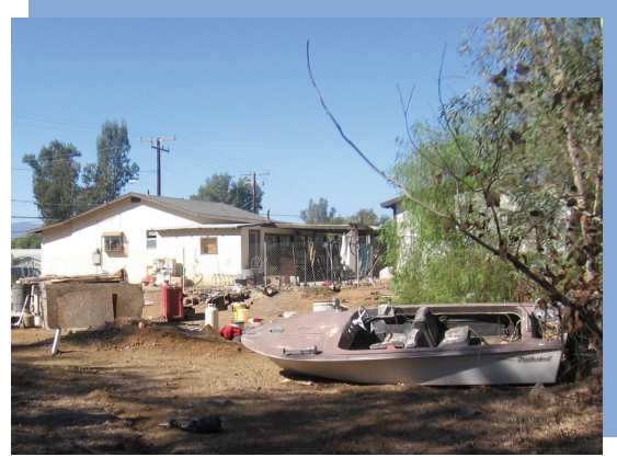
Excessive trash & debris