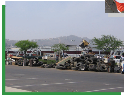
Tires were a popular item at the Cleanup

Mike O'Connor and the rest of the Admin Team have completed the move to the Transportation Annex building located at the corner of 14th and Lemon Streets, across from the Altura Credit Union. Jay and Emma have retained their office spaces on the 12th floor of the CAC. The new office is located on the ground floor adjacent to the covered parking structure. Parking is a little tight so if you are planning a visit you may find yourself parking offsite. Our office can be accessed from the western corner of the parking lot through a security gate. Our new mail stop number for the Admin Team at the Transportation Annex building is #2137. Stop by and say hi sometime! Jim Monroe