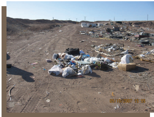
One misdemeanor cite issued for this dump site near Ave. 73 in North Shore.