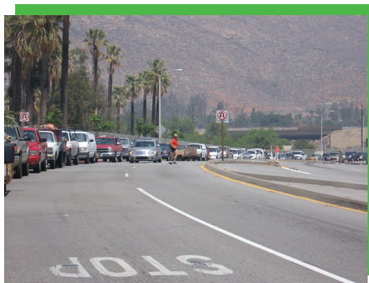
A long line of Jurupa residents waiting their turn to drop off their stuff!