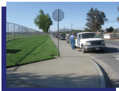
Residents of Mead Valley wait with their truckload.