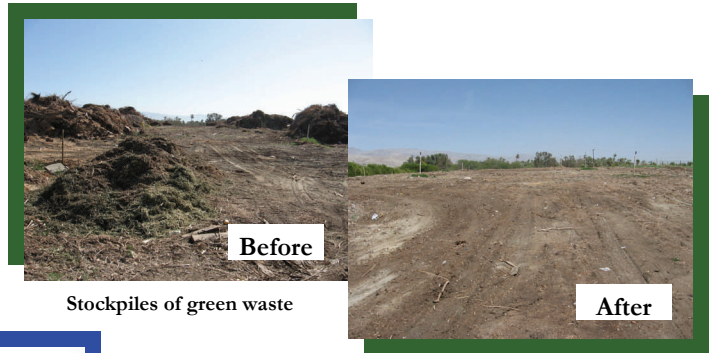
Stockpiles of green waste