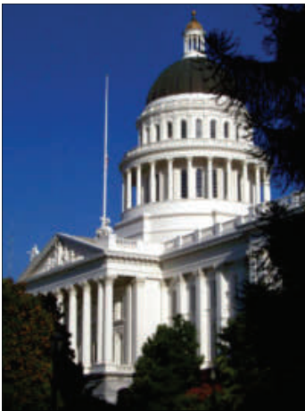
California State Capitol

"To enhance Public Safety and improve the quality of life in Riverside County, through proactive and timely code enforcement actions."