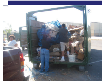
Over 64 tons of waste was collected.