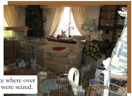
Sage residence where over 150 animals were seized.