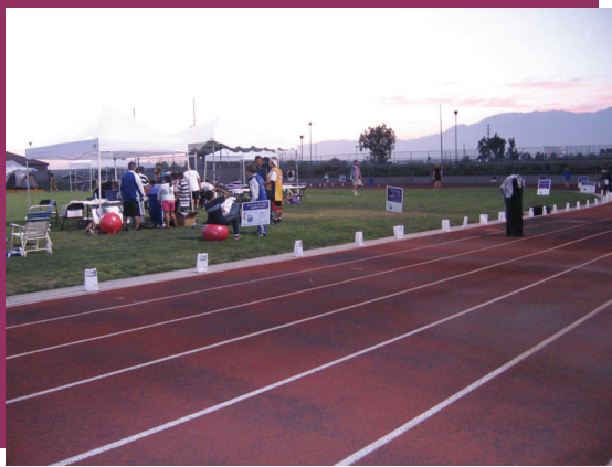
The Luminaria Ceremony at the American Cancer Society Relay for Life. The illuminated bags have names or pictures of love ones that have suffered with cancer.