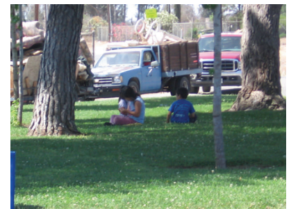
Children wait in the shade while their parents wait their turn at the Cleanup.