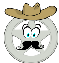
Cody the Badge